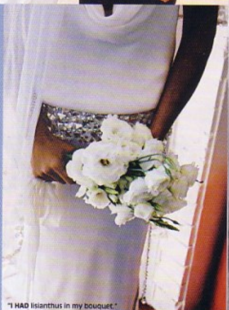
"I HAD Lisianthus in my bouquet."

“MY GOWN WAS COMPLETELY BACKLESS. It had a cowl-neck front, a straight-down, bias-cut skirt and, around the hips, a HAND-BEADED SWAROVSKI CRYSTAL BAND”