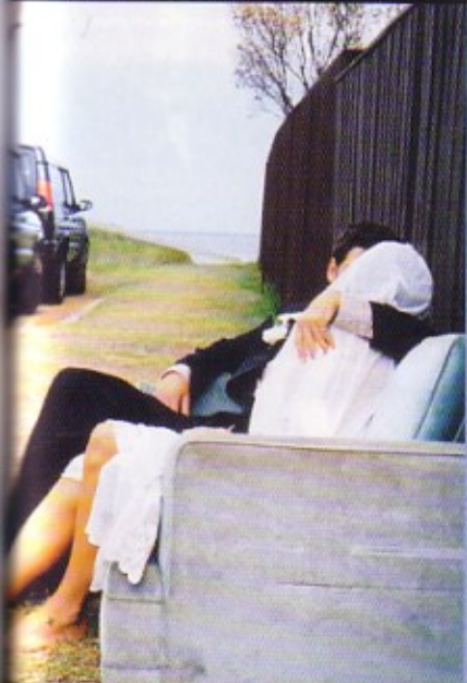
"MY HEELS were from Gary Castles Sydney."