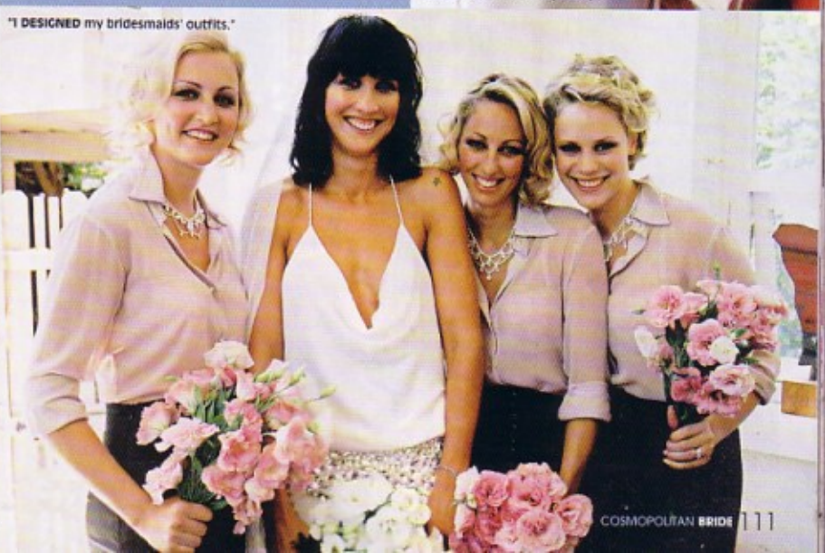
"I DESIGNED my bridesmaids' outfits."